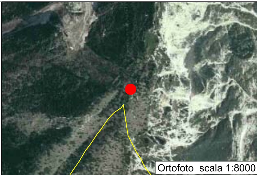
Ortofoto scala 1:8000