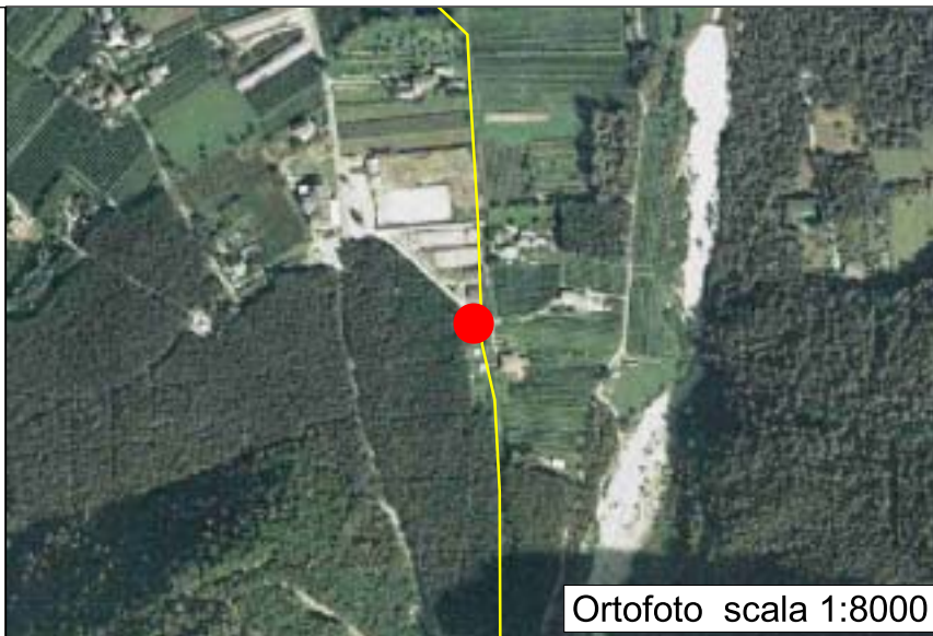
Ortofoto scala 1:8000