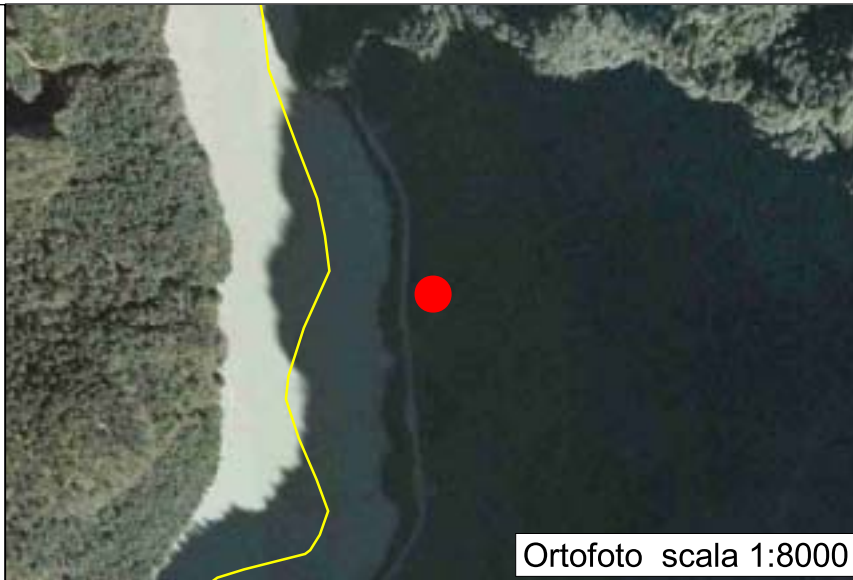
Ortofoto scala 1:8000