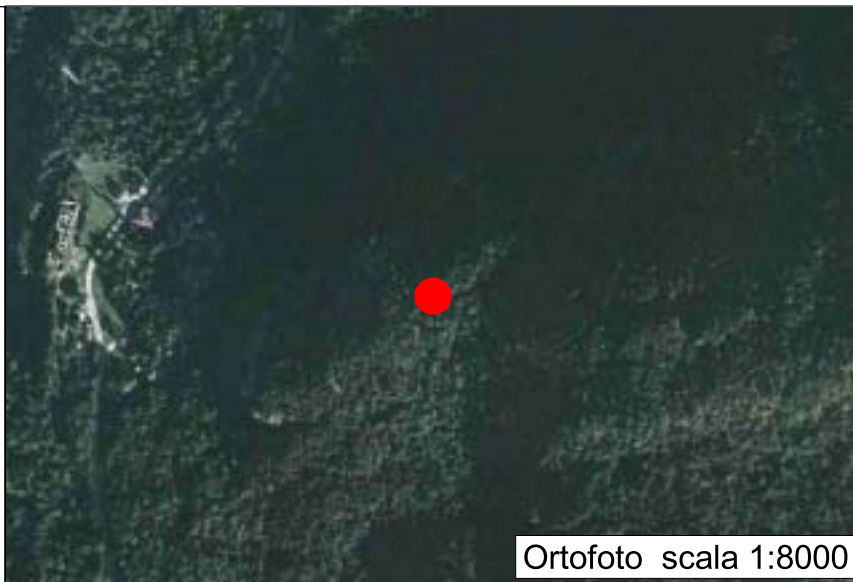
Ortofoto scala 1:8000